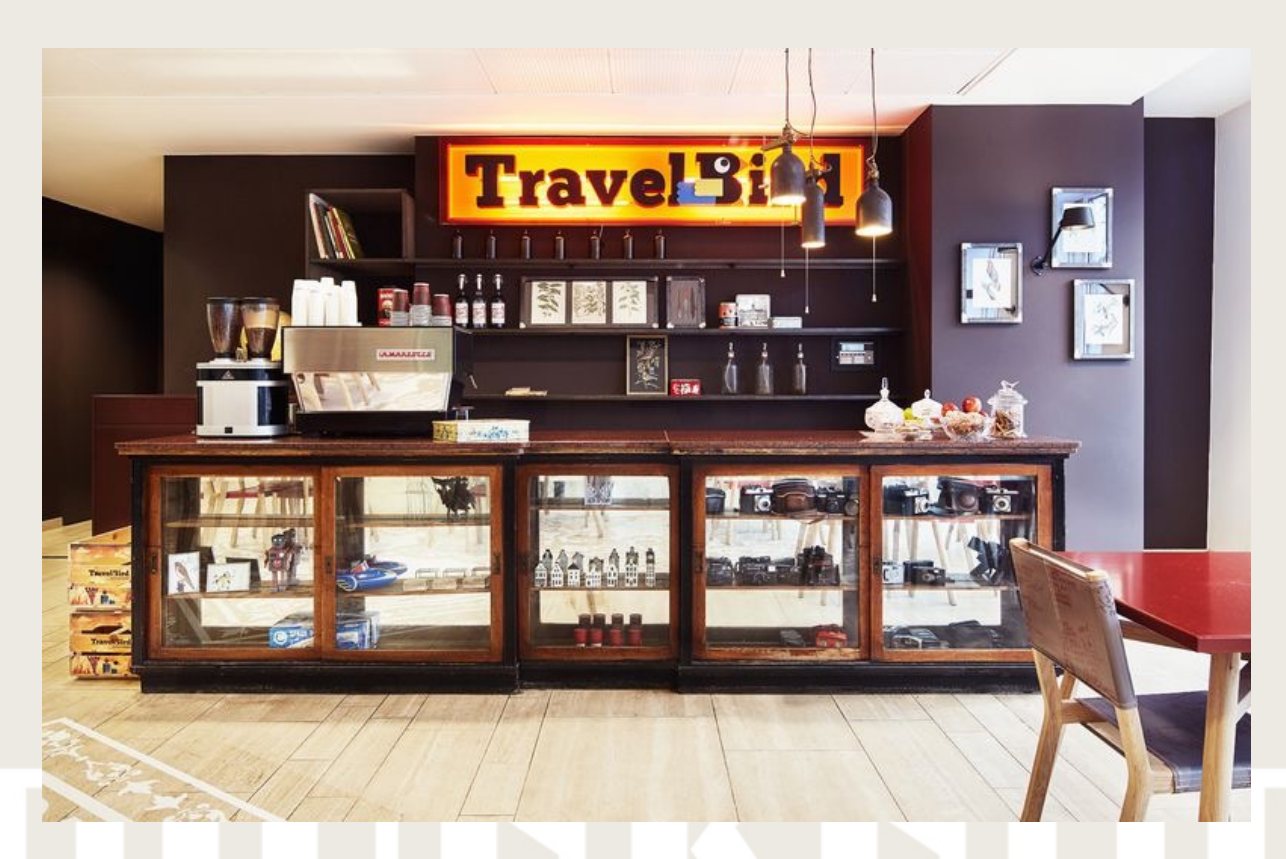
The coffee bar is a meeting place for employees and a reception for guests. Serving the best coffee in town to start the day.