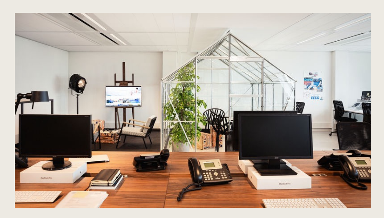
Spaces have been created for both informal and formal meetings on the work floor. In line with the colour and theme of that floor.