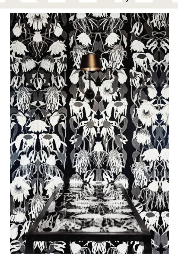
Studio JOB wallpaper for NLXL is applied on the walls as well as on the tables. Lighting by Anton de Groof for Tonone.